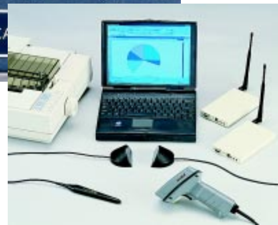
Optional data collection equipment

With an optional bar code wand and an infrared transmitter receiver, you can automate data collection. Scan bar codes to simplify the entry of pro numbers or employee ID. SimulCast can even document results of periodic weight accuracy tests. After you have stored a day’s worth of scale data and estimated information from the customer weight ticket, you can download information to a PC or printer via an infrared transceiver, RF