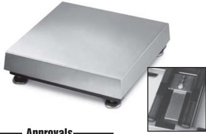
Optional stainless steel clamshell