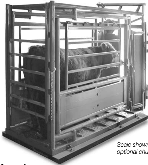
Scale shown with optional chute