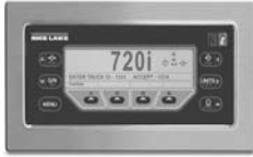
Panel Mount (CPU Enclosure Not Shown)