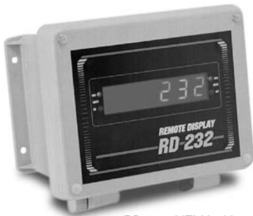
RD-232 NEMA 4X FRP Enclosure