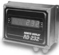
RD-232 compact stainless steel wall mount enclosure