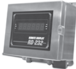
RD-232 NEMA 4X stainless steel wall mount enclosure